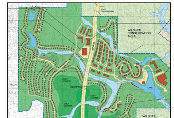
Lake Focused Cluster