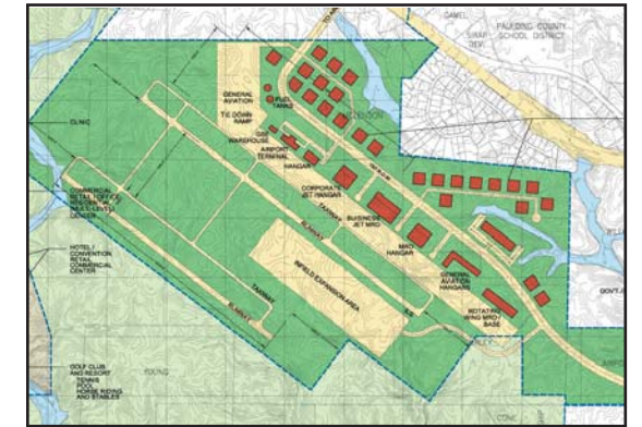
Airport and Airport Park Development

The initiative therefore creates a new model for public - private sector participation, while creating jobs and improving the quality of life of its inhabitants and those in the surrounding areas.