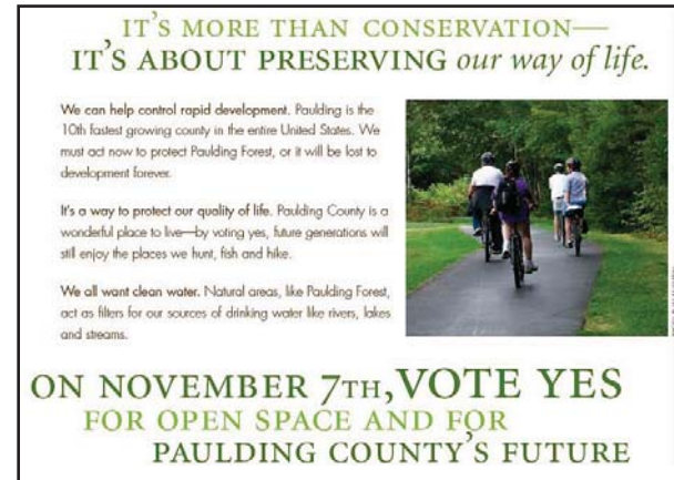
The Paulding Forest Initiative